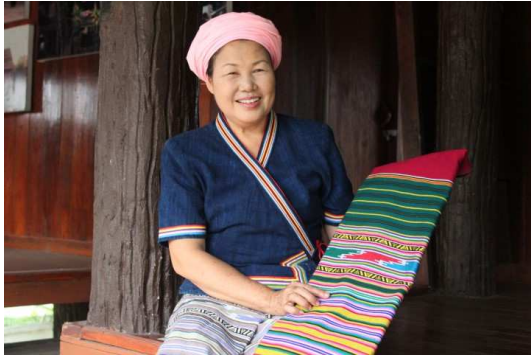
Figure 3. Tai Lue Culture.