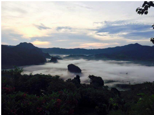
Figure 5. Phu Langka, Phayao.