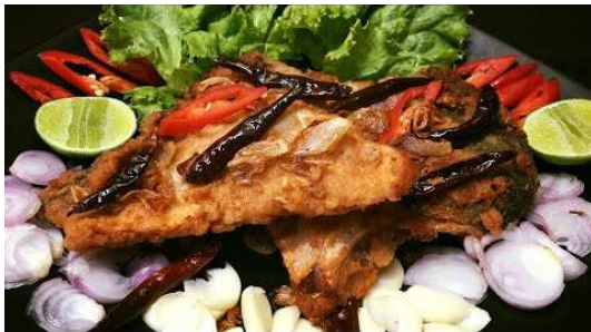
Figure 4 Food from pickled fish (Pla Som in Thai).